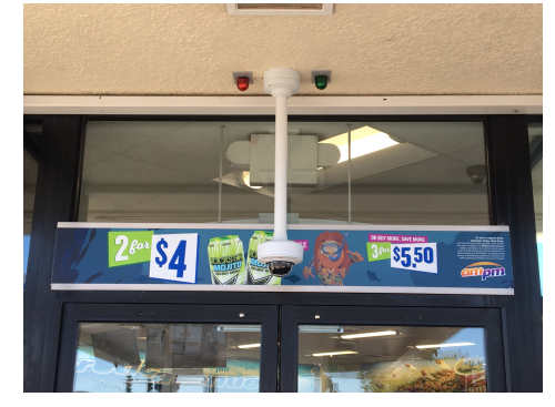
Washington AMPM - Install Photos, Yakima, WA with Axis Q3505 MK II Dome Cameras